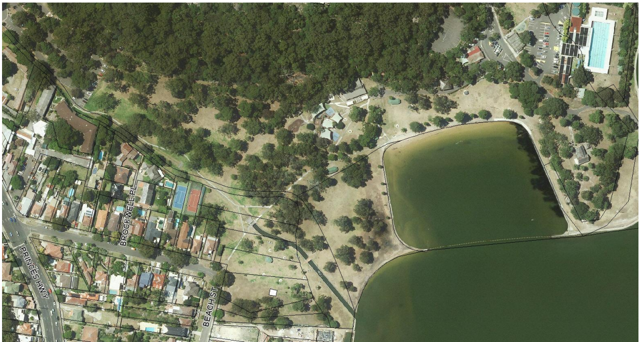
Aerial Shot of Carss Bush Park